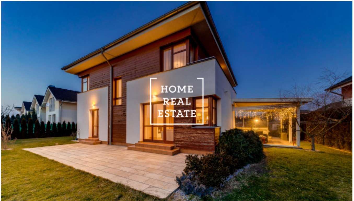
Kozáková 175/18, Praha - Pitkovice