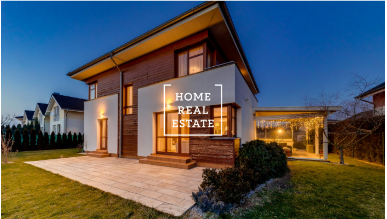
Kozáková 175/18, Praha - Pitkovice